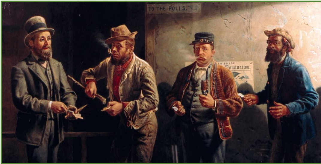
“American Citizens” (To the Polls), Thomas Waterman Wood, 1867, Watercolor on paper. One of T.W. Wood’s finest watercolor paintings, “American Citizens” will be on exhibit at the Vermont State House Card Room in the Fall Of 2021.